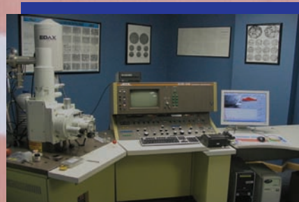
Scanning Electron Microscope